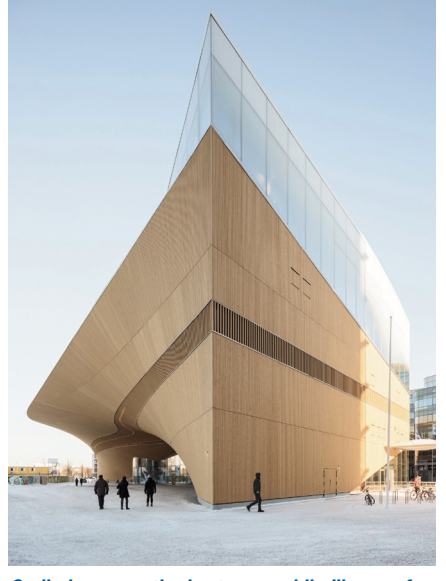
Oodi chosen as the best new public library of the year 2019 in the world.